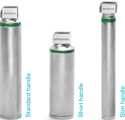
Hyper LED handles

Standard handle Most popular choice for routine cases